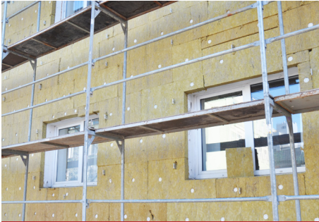
EXTERNAL WALL INSULATION

Through the Deep Retrofit Framework EITAS has procured some of Ireland's most experienced and competent Contractors to deliver best in class installation standards. The EITAS Management team will design a solution that meets with the specific needs of each home and then manage the installation professionals through to completion and full system commissioning.