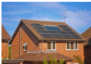
SOLAR THERMAL & PV