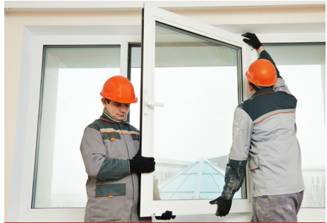
WINDOWS AND DOORS